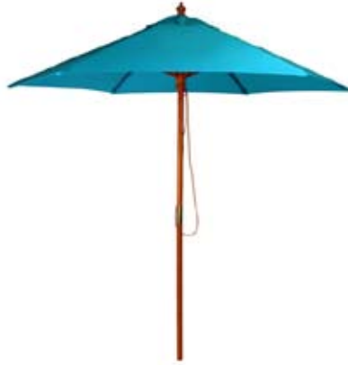
Wood Mast Parasol