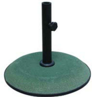
30kg Parasol Base