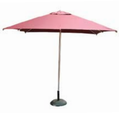
Milan Square Parasol