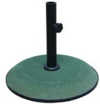
15kg Parasol Base