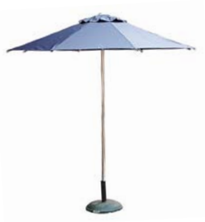
Milan Round Parasol