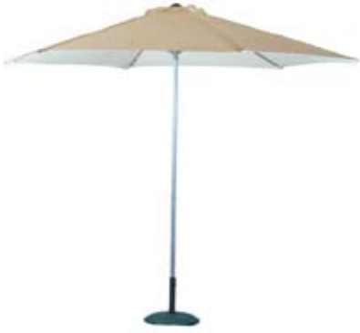
Standard Aluminium Mast Parasol