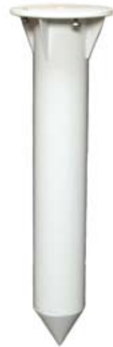
Salisbury Ground Sleeve