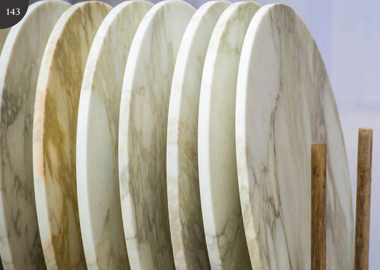
TABLE TOPS - MISCELLANEOUS

In this section we offer Inox Aluminium, Oak, Teak, Glass, Marble, Granite and Zinc tops. Most of these table tops can be used both externally and internally if required.