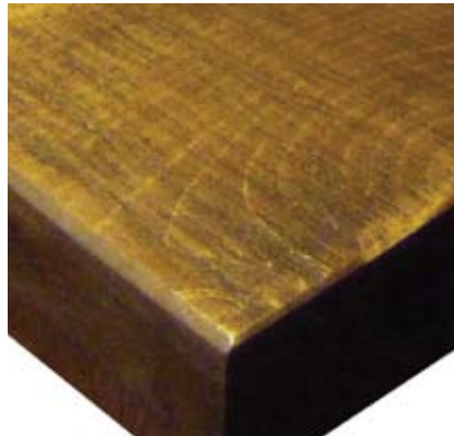
Pine / Redwood