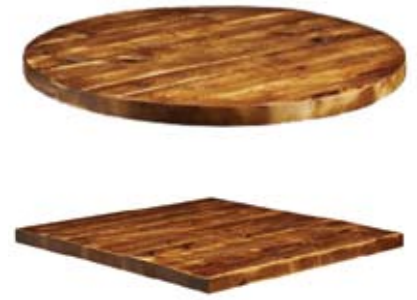
Rustic Pine Tops 32mm Pine tops in a rustic finish 60,75,90 or 120cm Dia 60x60, 70x70, 80x80 or 90x90cm Square 120x70 or 180x70cm Rectangular