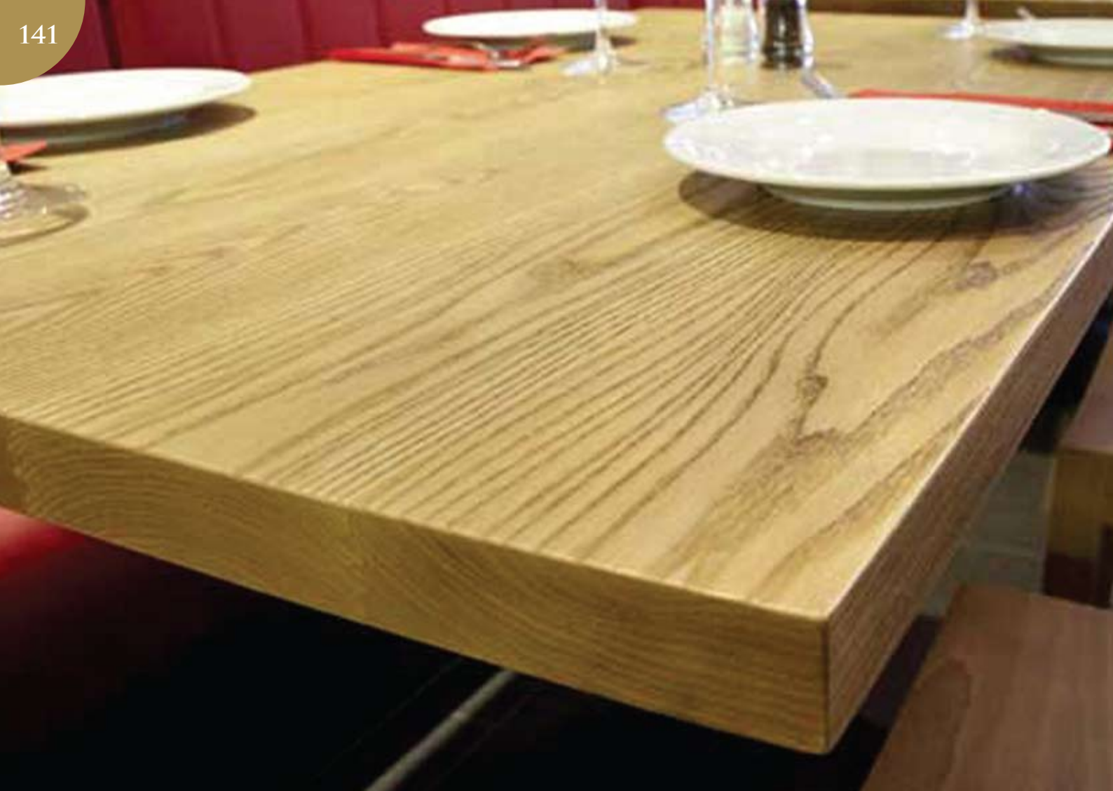
TABLE TOPS SOLID WOOD & VENEER

The timeless, natural, classic look of a solid ash table top really is a sight to behold. In our opinion there is no better material for a table top in the market. Our solid wood table tops are UK manufactured to our customers' requirements. We are able to use Oak or Beech, but Ash is the wood we always recommend for its grain, looks and stability. We stain and polish all tops in house through our spray shop, finishing the tops with several layer of a matt lacquer for aesthetic and practical purposes.